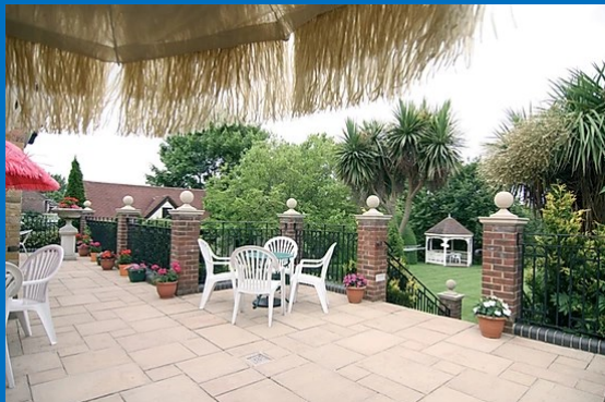
View of the terrace