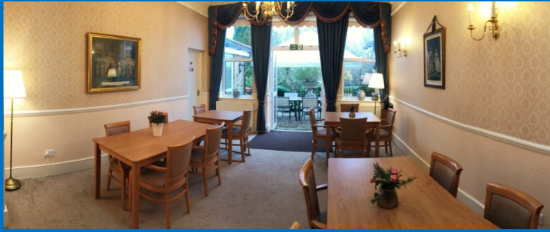
The comfortable dining room with garden views