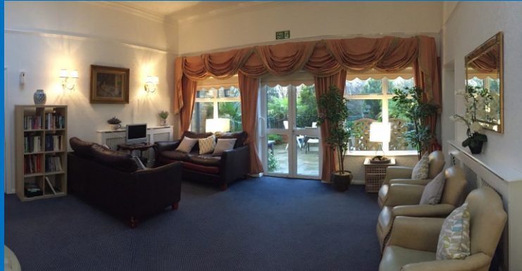
Lugano's quiet lounge